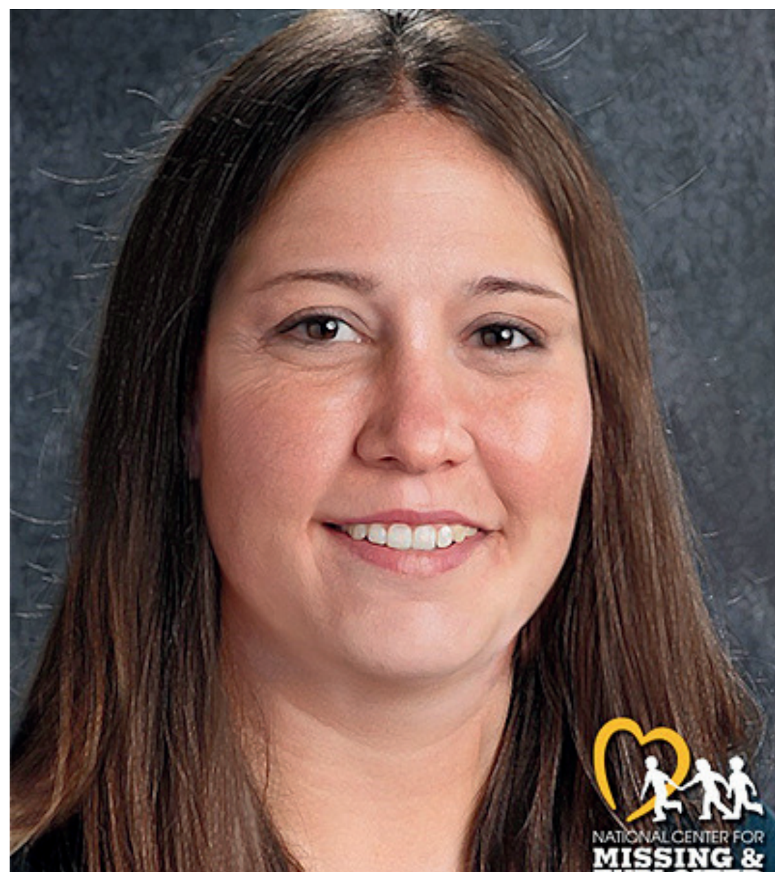
Age progression 40-years-old